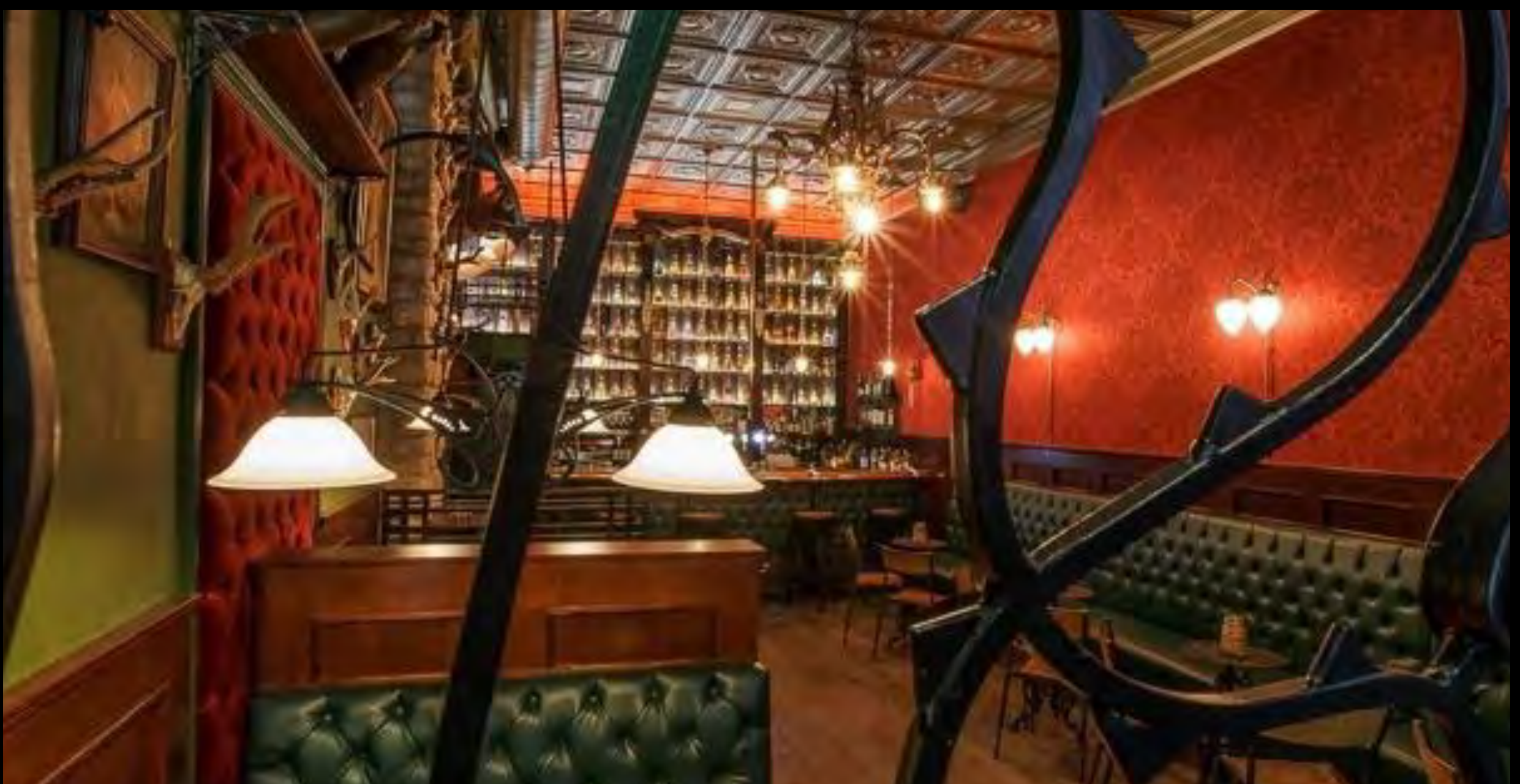
Cafe De Oude Hoer: www.cafedeouwehoer.nl