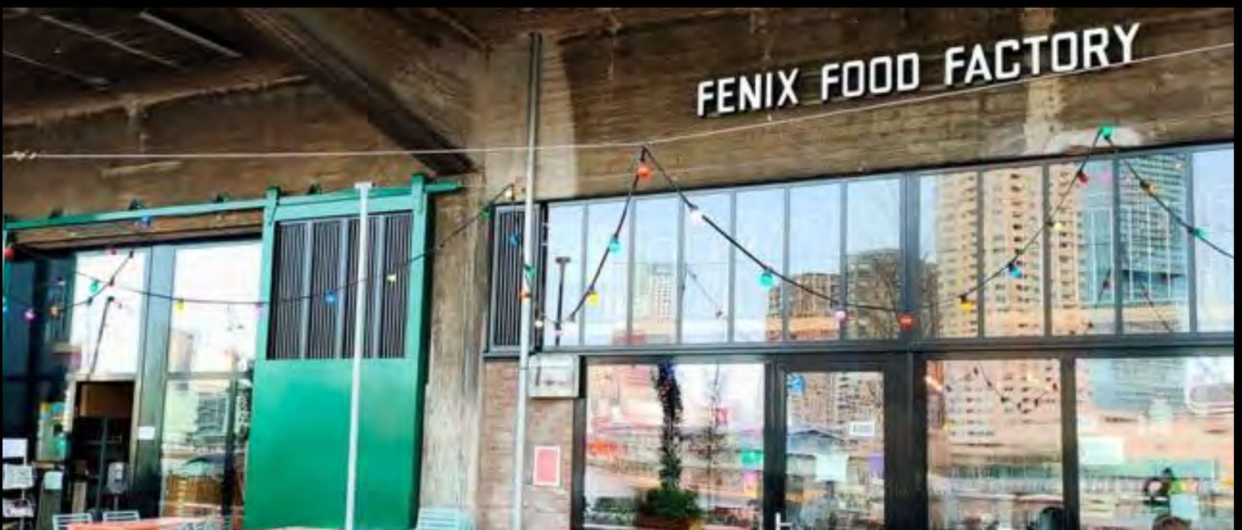
Fenix Loodsen: www.fenixfoodfactory.nl